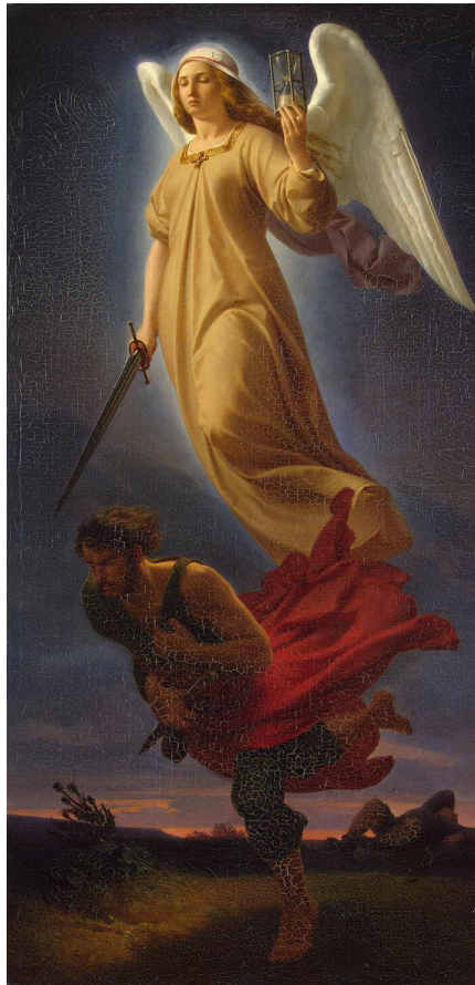
'Nemesis' by Alfred Rethel (1816 – 1859)